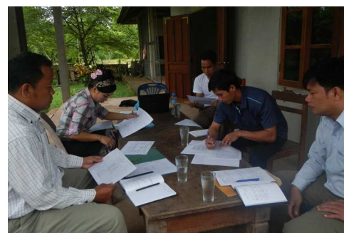
WASRO and Mirep teams collecting operation data from Feuang Site

The concessionaire reported new households connections and some difficulties with Non-Revenue Water mainly linked to commercial issues with customers. He is asking for some support to analyse the problem of illegal water connections in the service area. Local authorities are expecting a report on the situation soon in order to provide assistance to the concessionaire.