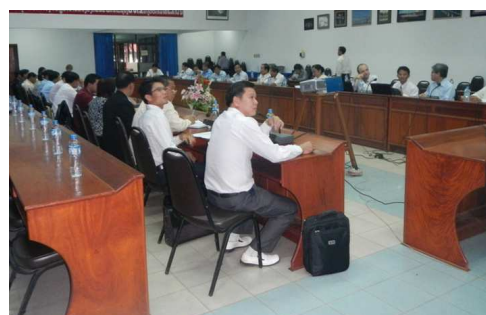
Mirep 3 Inception workshop in MPWT, 08/06/2012