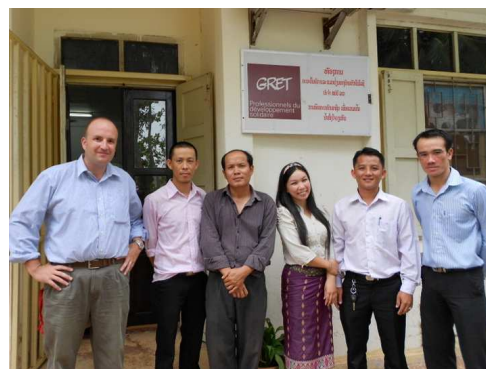
The new Mirep team in July 2012

Mirep 3 is funded by the Syndicat des Eaux d'Iles de France ( SEDIF ), the Agence de l'Eau Seine Normandie ( AESN ), Aquassistance , provincial authorities and local entrepreneurs.