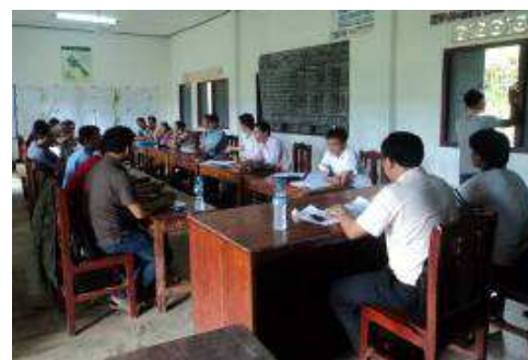
Feasibility study in MeuangPa, Sayabouri province, in September